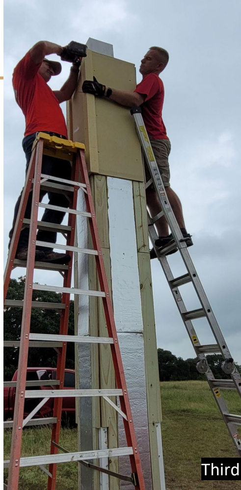
Third workday finishing the tower