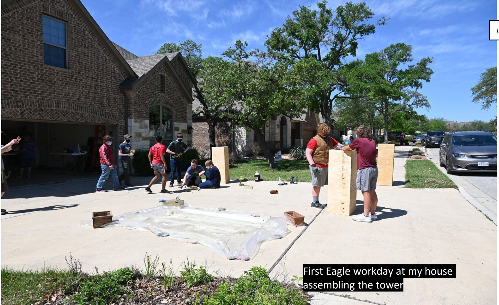
First Eagle workday at my house assembling the tower