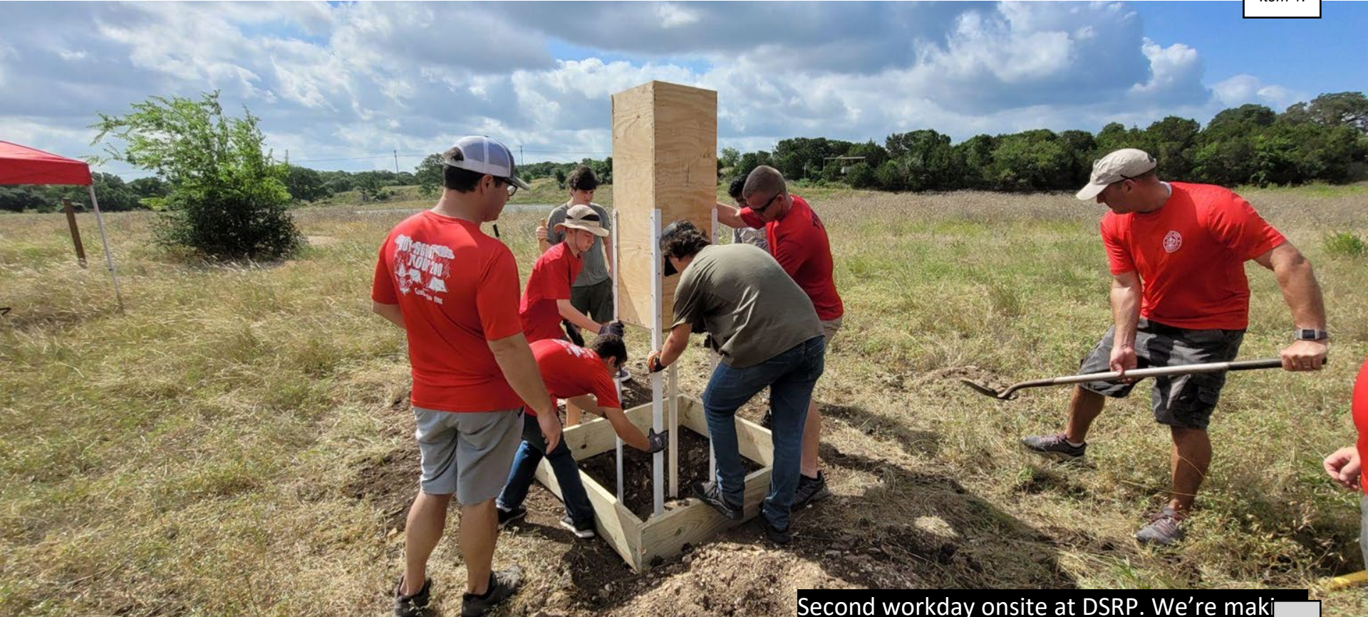
Second workday onsite at DSRP. We're making the foundation and tower bottom.